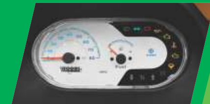
Advance Information display