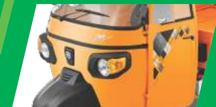
Attractive design and looks