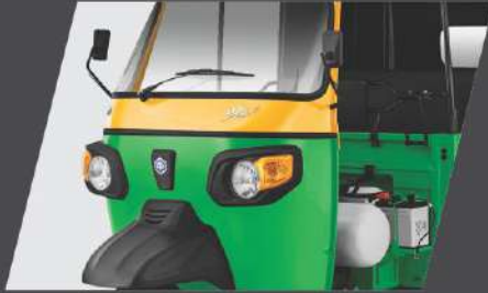
Attractive design and looks