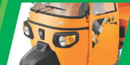
Attractive design and looks