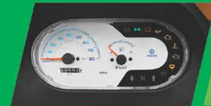
Advance Information display