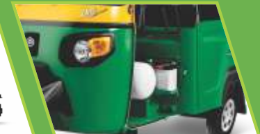
40 ltr. CNG cylinder 20.6 ltr. LPG cylinder