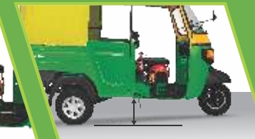
Higher ground clearance

Please note that the images and technical specifications shown in the chart may showcase accessories and equipment which are not part of the standard fitment. Piaggio reserves the rights to alter the technical specifications and features without prior notice.