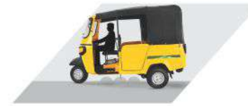
Better Ground clearance