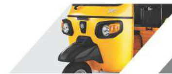
Sleek Italian Design