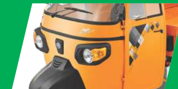
Attractive design and looks