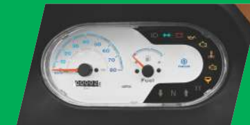
Advance Information display