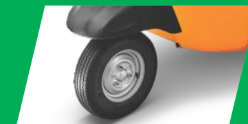
Tubeless Tyres First in 3 Wheeler Segment