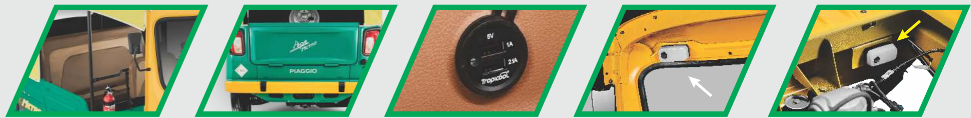
Dual colour seat