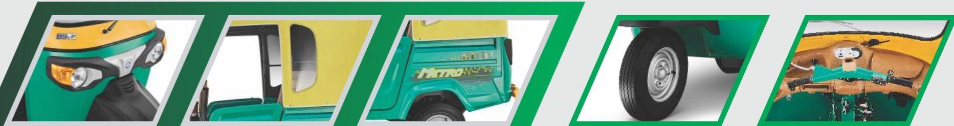
Stylish design with new decal