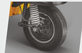
Bada Tyre 12"