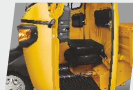
All new cabin