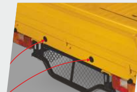
Reverse Parking Sensor*