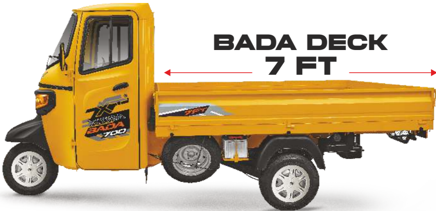
BADA DECK 7 FT