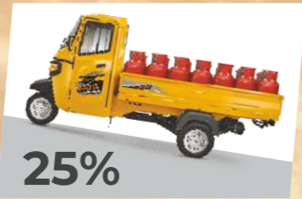
Bada Torque & Gradeability