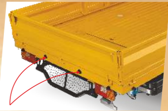
Reverse Parking Sensor*