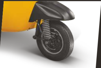
Bada Tyre 12"