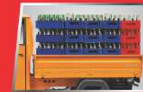
XTRA LONG DECK