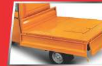
XTRA STRONG PLATFORM