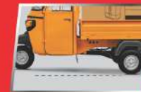
XTRA LONG WHEEL BASE